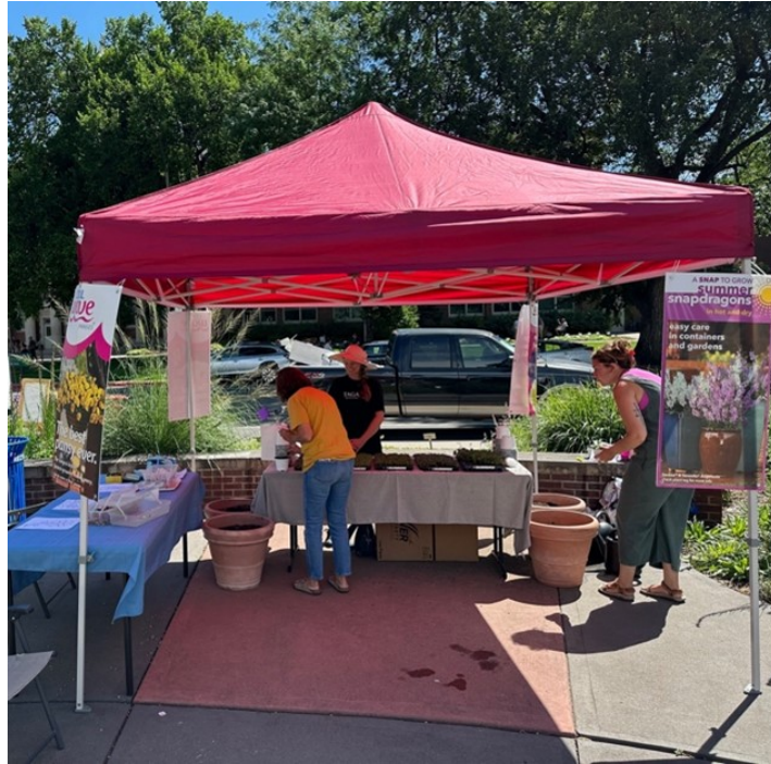
In Color booth provided a planting activity for kids of all ages!