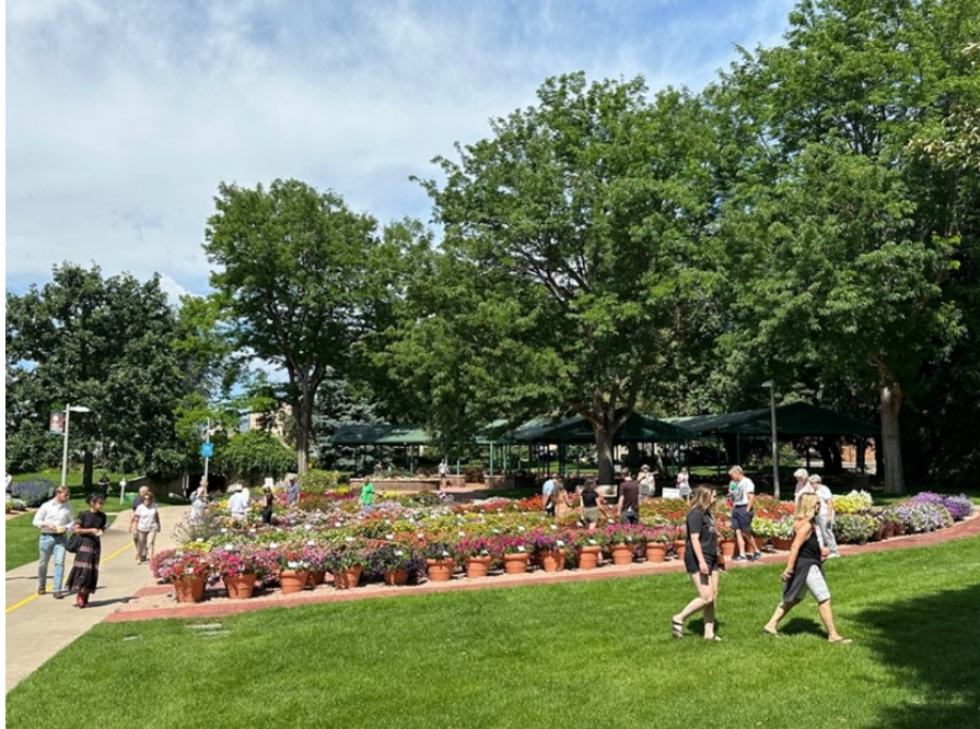
Visitors observing the container plantings on public evaluation days.