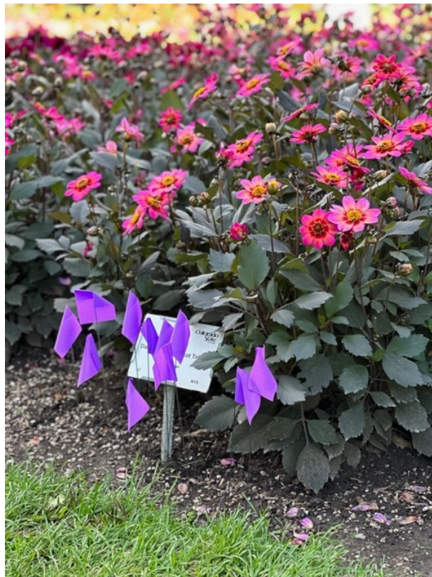
Flags in front of one of the popular dahlias, Dalegria® Apricot Tricolor.