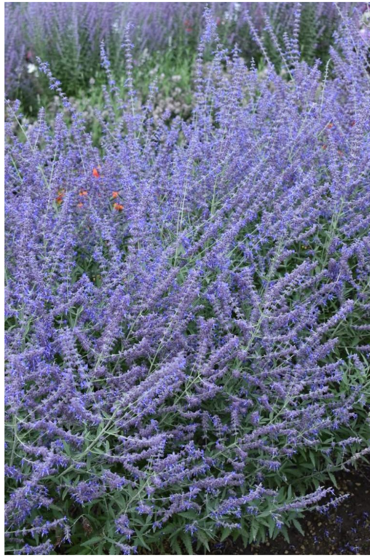
Rosa Sunbeam Veranda® (Rosa x 'Korfloci52' PP23,314) from Star® Roses and Plants

Glossy, dark green foliage made the bright yellow flower color even more stunning. Blooming started in June and lasted well into September. The compact size make this a great choice for smaller gardens spaces. Plants had excellent winter hardiness.