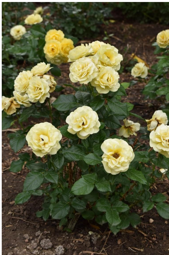
Rosa Cherry Frost™ ( Rosa x 'Overredclimb' PP31,286) from Star® Roses and Plants

Abundant bright red flowers and good disease resistance make this a good climbing rose for Colorado. Clusters of small flowers kept repeating throughout the growing season in flushes for long lasting color. It had excellent winter survival.