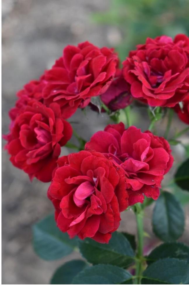
Sedum Prima Angelina ( Sedum rupestre ) from Darwin Perennials®

Great neon yellow foliage makes this an excellent foliage plant in the summer and also is quite showy in the winter with a nice shade of red. The spreading growth habit is very uniform and a great choice with rock gardens or combined with other Sedums for additional color contrast. Prima Angelina is superior to the straight Angelina with better branching and growth habit while also being less brittle.