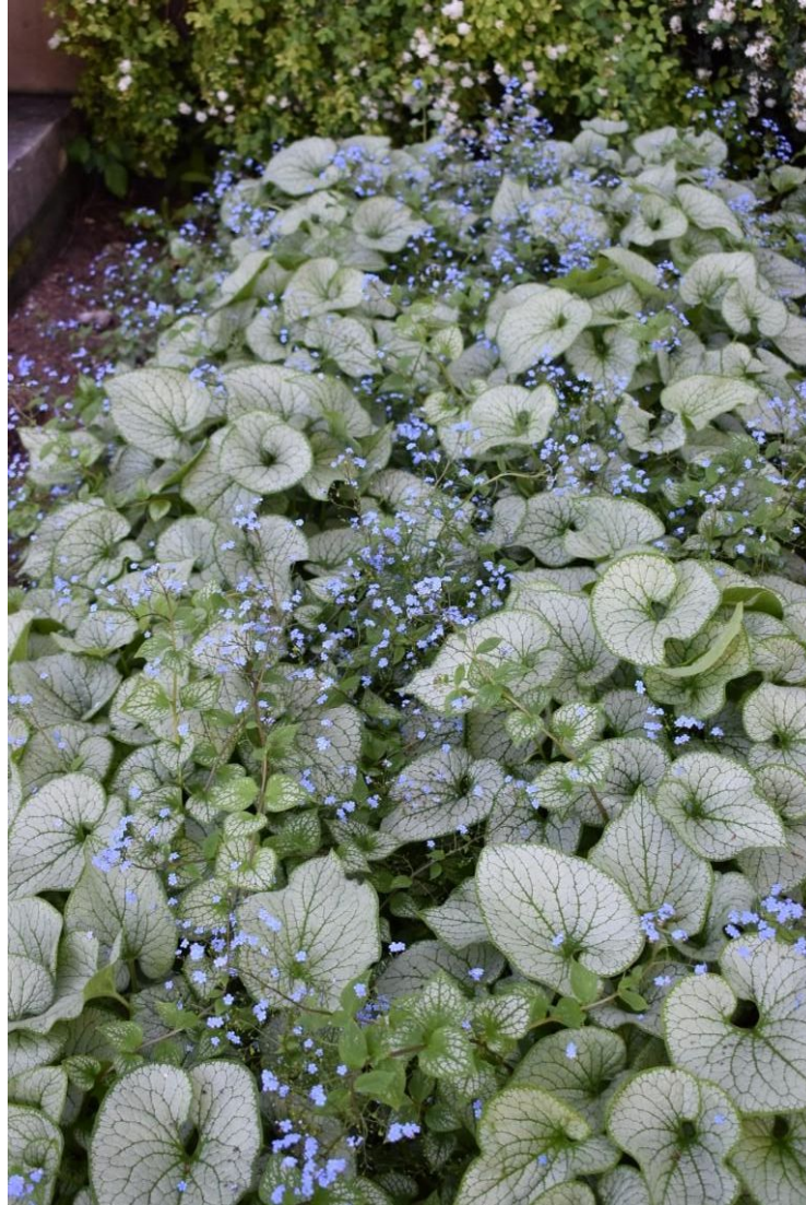
Eupatorium Euphoria™ Ruby ( Eupatorium purpureum 'FLOREUPRE1', PP31,668) from Darwin Perennials®

Shorter and more compact than the species, this is a nice medium size plant for the modern landscape. This was a unanimous choice for the "Top Performer" award with dependable light ruby/lilac colored flowers that combines well with dark leaves and stems. It was noted to be an excellent pollinator plant.