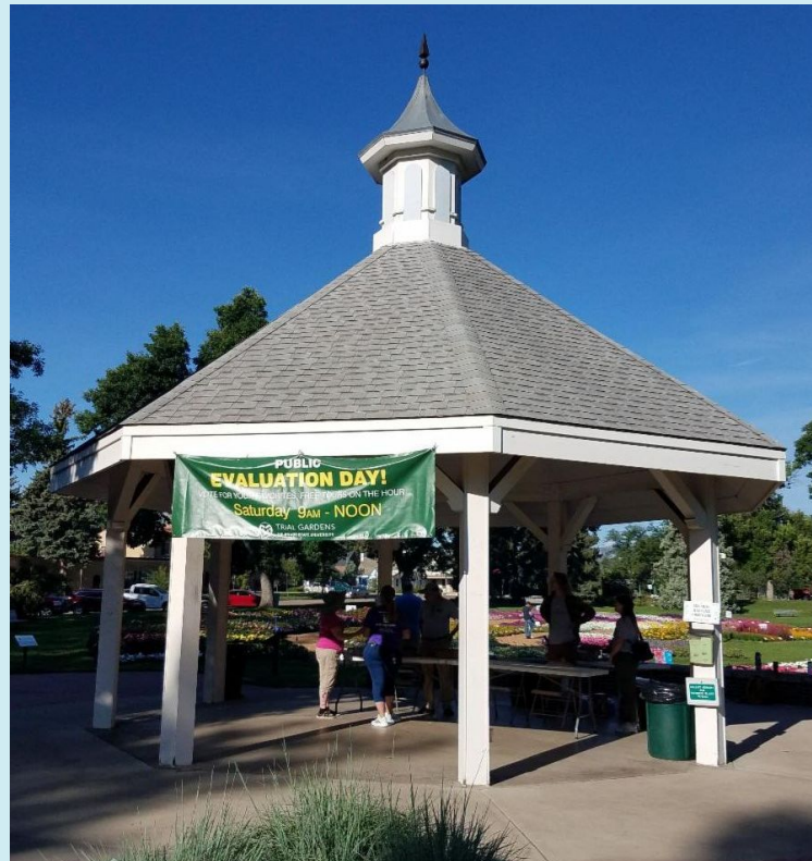
The Consumer Evaluation Day was held at the trial gardens on Saturday, August 6, 2022

Thanks again to all of our cooperators for helping to make our 2022 trials the success they are.