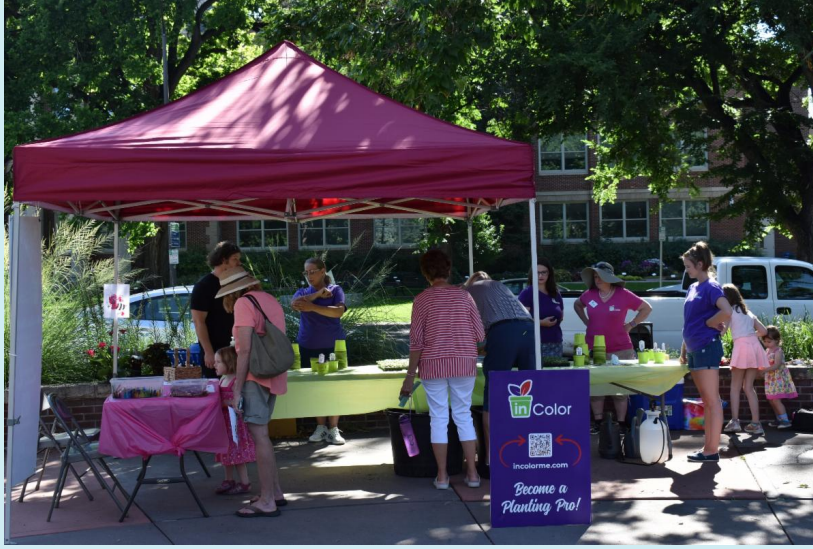
Tagawa Greenhouse provided an area for kids and "kids at heart" to experience planting flowers and taking something home to grow.