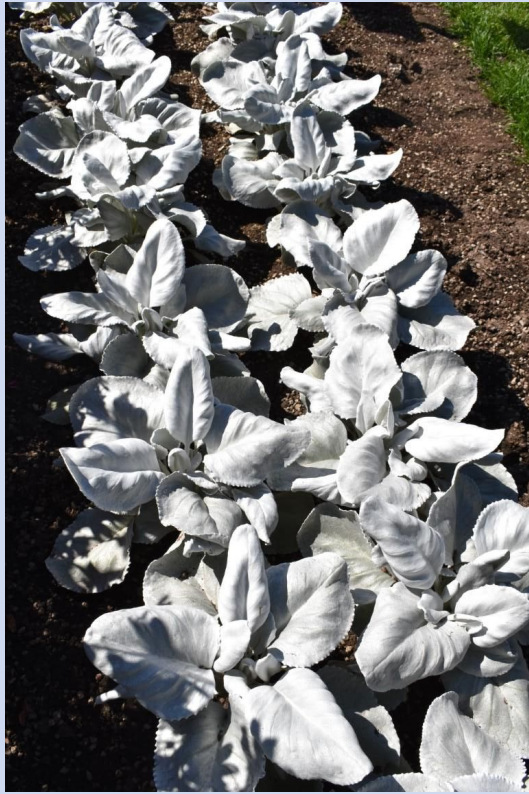
Senecio 'Angel Wings' from Concept Plant

A striking plant in the landscape with its large, broad, silvery white, velvety leaves. This unique plant was easy to spot in the trial and was the top favorite of the public. It will make an excellent backdrop to green-leaved plants and colorful flowering perennials in sunny, drought tolerant borders, rock gardens, succulent gardens, and containers.