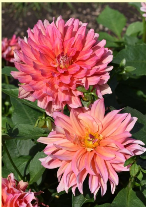
Dahlia Dahlinova XXL Acapulco from Dümmer Orange

Plants have great vigor with impressive bright flowers. Flowering was solid all summer and created a lot of flower power. Plants were healthy and foliage stayed clean all summer. A great garden performer as well as making a super cut flower.